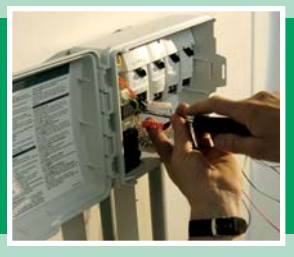
Installation is a snap with the roomy cabinet and horizontal terminal strips