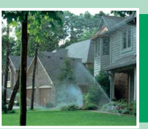
Reinforces Rain Bird's proven track record for quality, reliability and homeowner peace of mind

Take a few moments right now to review the Inside Story, then see your Rain Bird distributor for all the details about ESP Modular Controllers.